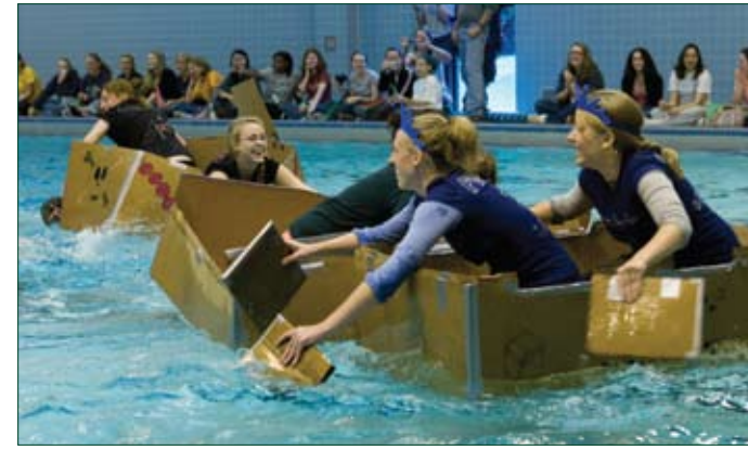
Students in Sweet Briar's introductory design course build and race boats made of 20 pounds of cardboard and 50 feet of duct tape in the annual regatta.

All agreed that the event was a lot of fun and that the students learned about using teamwork to finish a big project on a tight deadline.