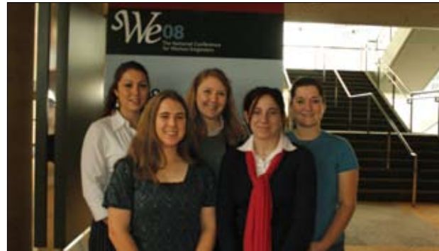
First year engineering students attend Society of Women Engineers conference in Baltimore, MD.