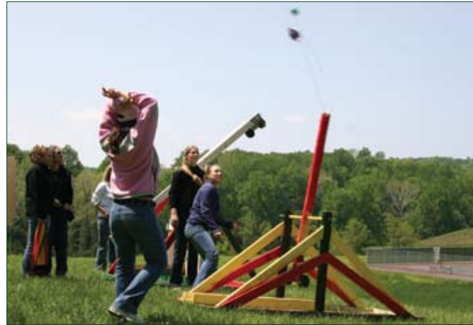
Our courses routinely emphasize hands-on projects. Students in this year's dynamics course used their design skills in Autodesk Inventor and their computational and modeling skills in MATLAB to build and successfully model a working trebuchet.